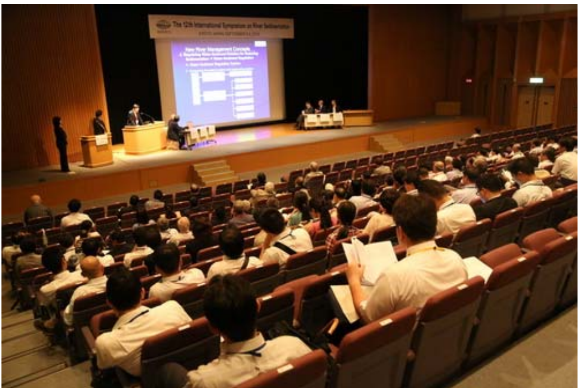
Opening ceremony of the 12 th ISRS held in Kyoto

During the Symposium, the President of WASER organized the 1st WISA (Workshop on International Sediment Advances) which brought together representatives of the main international organizations (ISI, IAHR, IAHS and ICOLD) active in Sediment research.